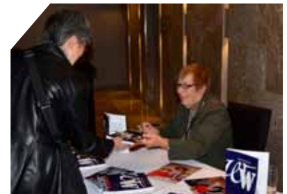
A satisfied customer